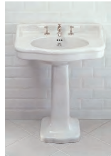
LA CHAPELLE Paris 1902 PAGE 14