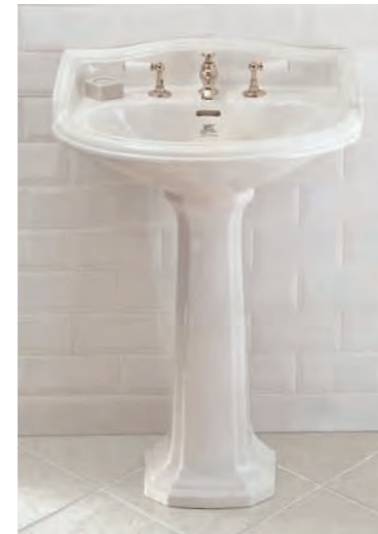
LISSA DOON Scotland 1870 PAGE 4