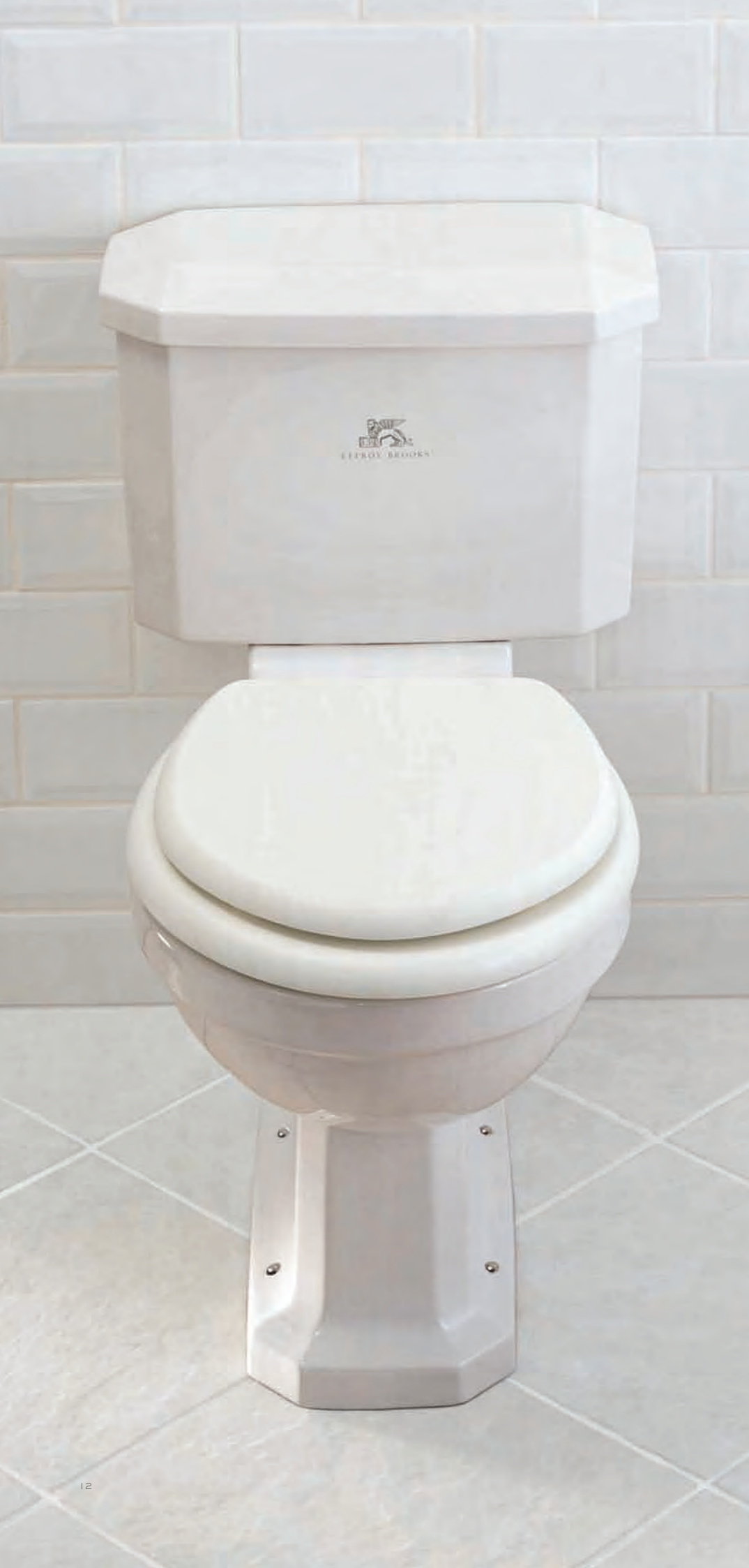
LEFROY BROOKS CLASSIC CLOSE COUPLED PAN LB 7207 AND CISTERN LB 7208 WITH CERAMIC LEVER LB 1307 AND WC SEAT LB 7241 W465 x D710 x H745mm