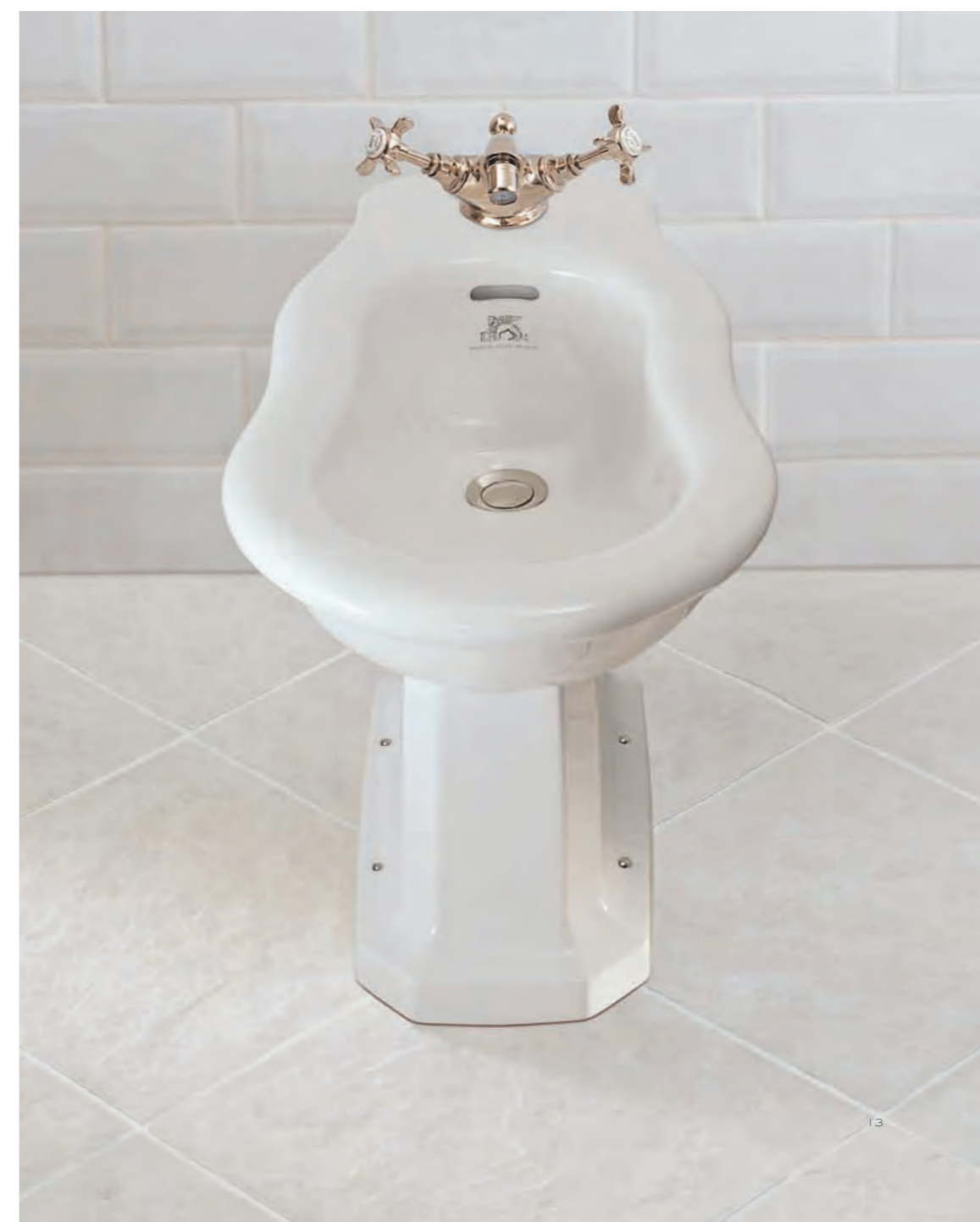
LEFROY BROOKS CLASSIC BIDET LB 7205 WITH MONOBLOC AND POP-UP WASTE LB 1199 W385 x D595 x H396mm

FINISHES - SILVER NICKEL, CHROME, ANTIQUE GOLD AND SATIN NICKEL.